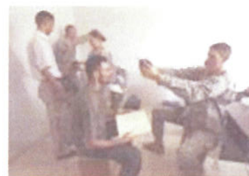
PFC Graves takes a picture of an Iraqi Police Applicant during Iraqi Police Recruitment on the 15th.