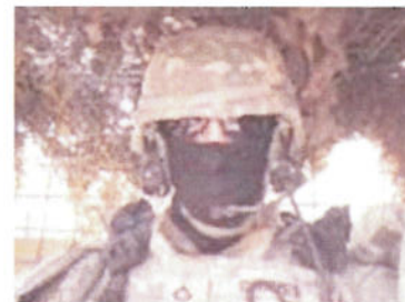
Can you guess who I am? I am a proud Warfighter of First Platoon.

As always, all soldiers here appreciate the dedication and sacrifices made by their loved ones back home. The support never goes unappreciated, and the friends and families back home are always in our minds and hearts. Thank you all for all that you do. Warfighters, signing out.