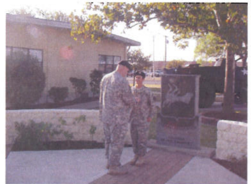
SPC Bass promotion to SGT with SSG Boyd pinning on her stripes.