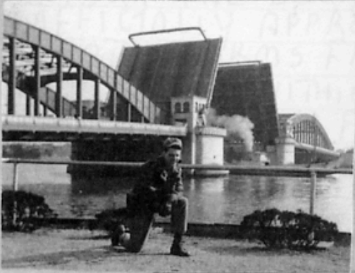
REAR AREA CAMP BURNESSE "2" AVE. DRAW BRIDGE OPEN FOR SUMIDA RIVER TRAFFIC