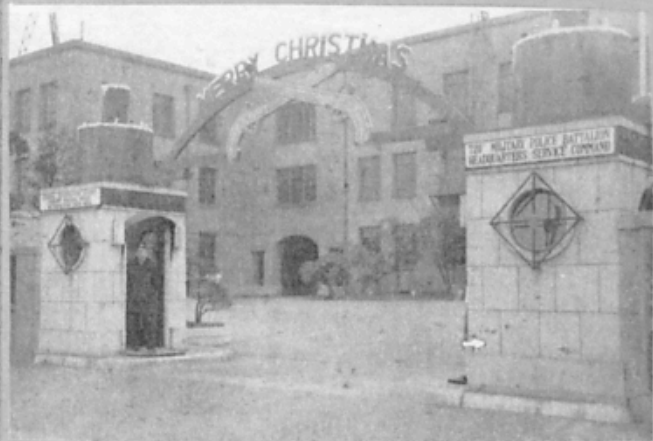
MAIN GATE ENTRANCE — MOM AND POP SHOPS IN BACKGROUND