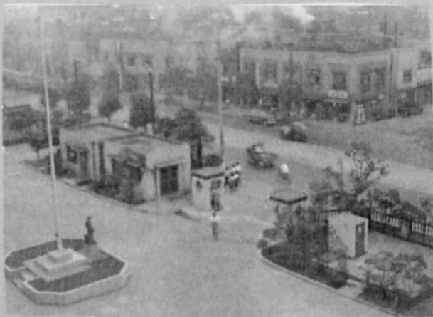
"Z" AVE. MAIN GATE RIGHT GUARD BOX