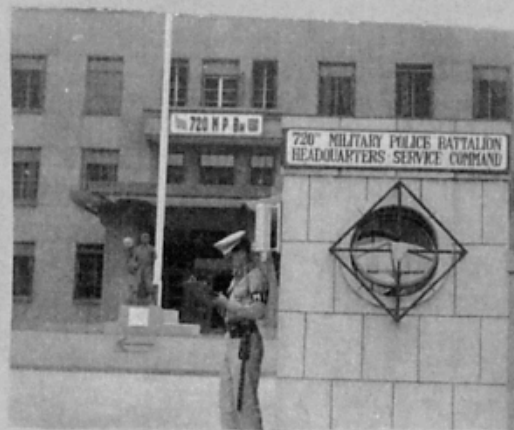
"Z" AVE MAIN GATE LEFT GUARD BOX