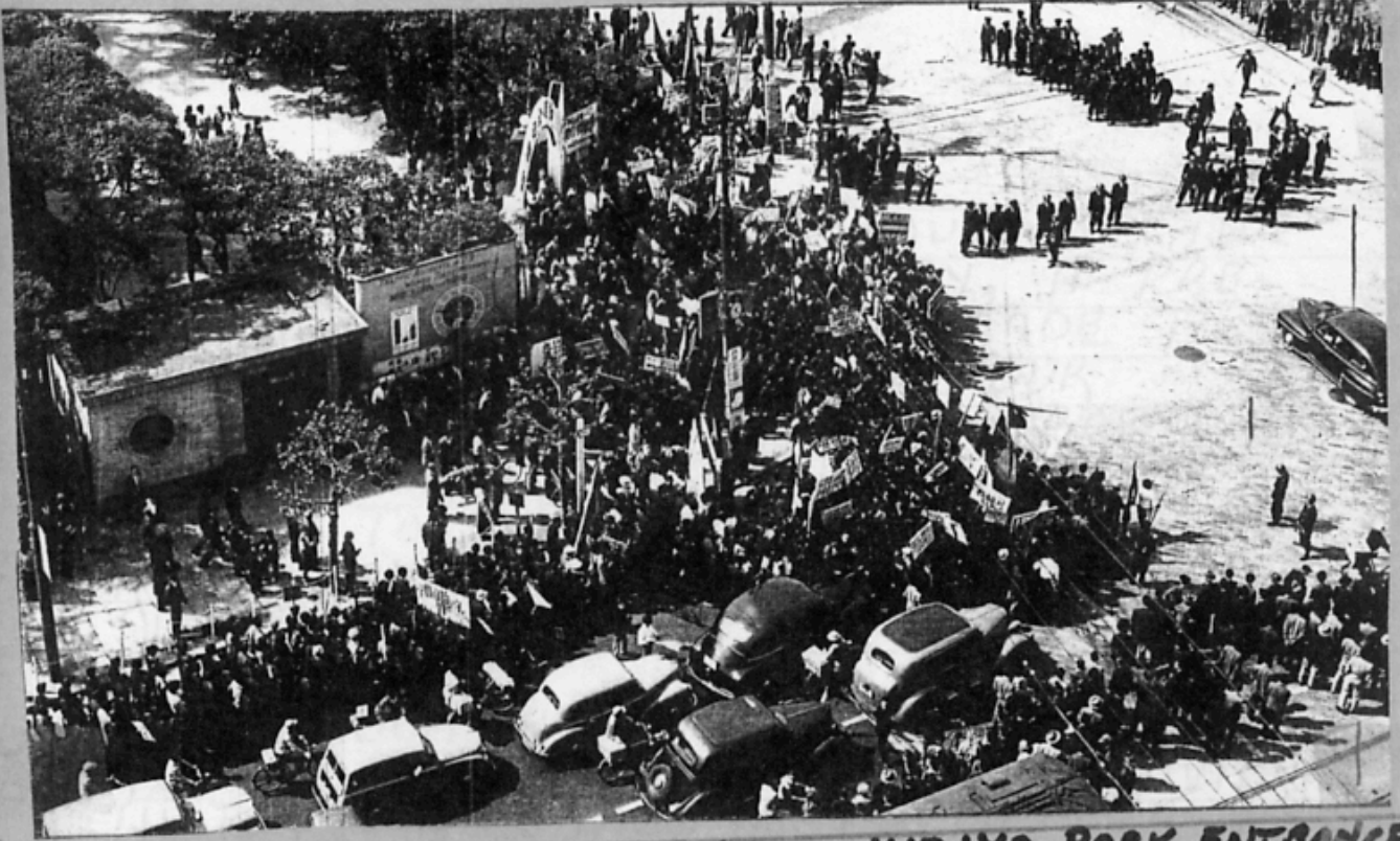
COMMUNISTS RIOTERS FORMING AT HIBIYA PARK ENTRANCE TO BEGIN THEIR MARCH ON THE JAPANESE IMPERIAL PALACE