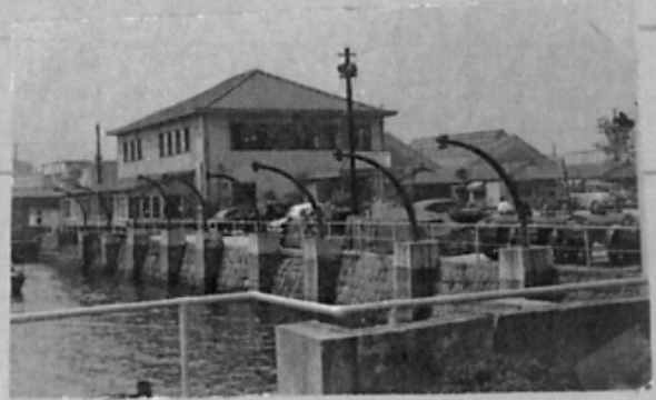
SUMIDA RIVER, "2" AVE. DRAW BRIDGE CLOSED POSITION