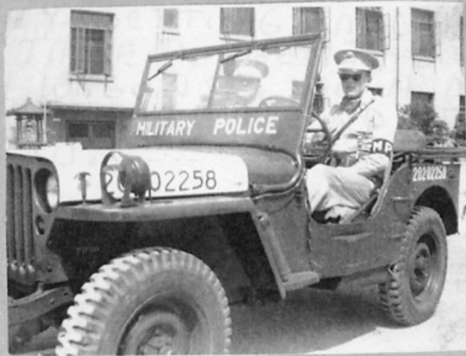
OPEN JEEP SUMMER KHAKI